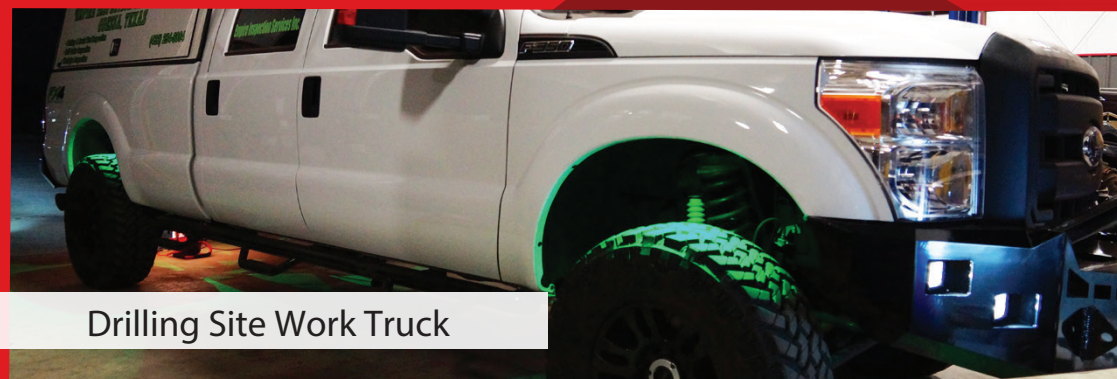
Drilling Site Work Truck